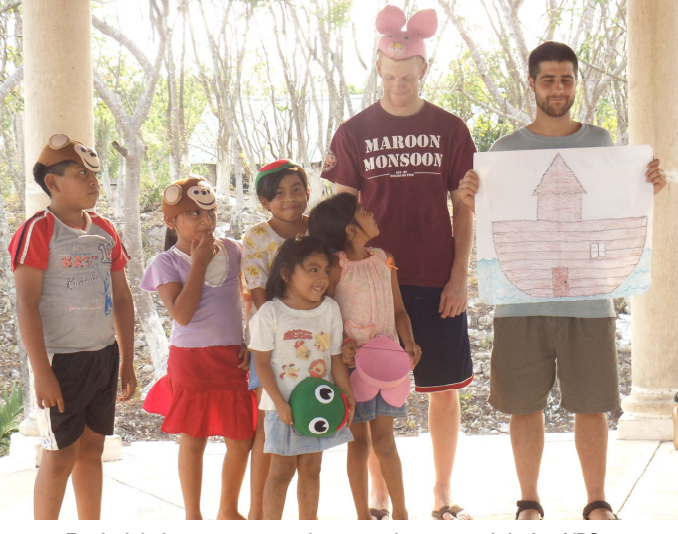
Fredericksburg team members monkey around during VBS.

The soft voices of the family who shared their morning palm-thatched-roof homes with us mix with the sounds of the men working in the forge a ing ceshort distant away. They bang away on redment by hot metal to make tools-machetes, hammers and hatchets-the way Mayan men have for generations. In Mexil, the two black- seal the roofs and pour the floors of small smith shops create quite a cacophony.