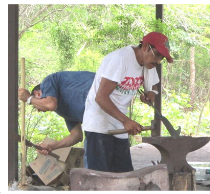
Mexil is known for its metal tool-making industry.

Air circulating through a swaying, mesh hammock cools the body after spending the early hours mix-