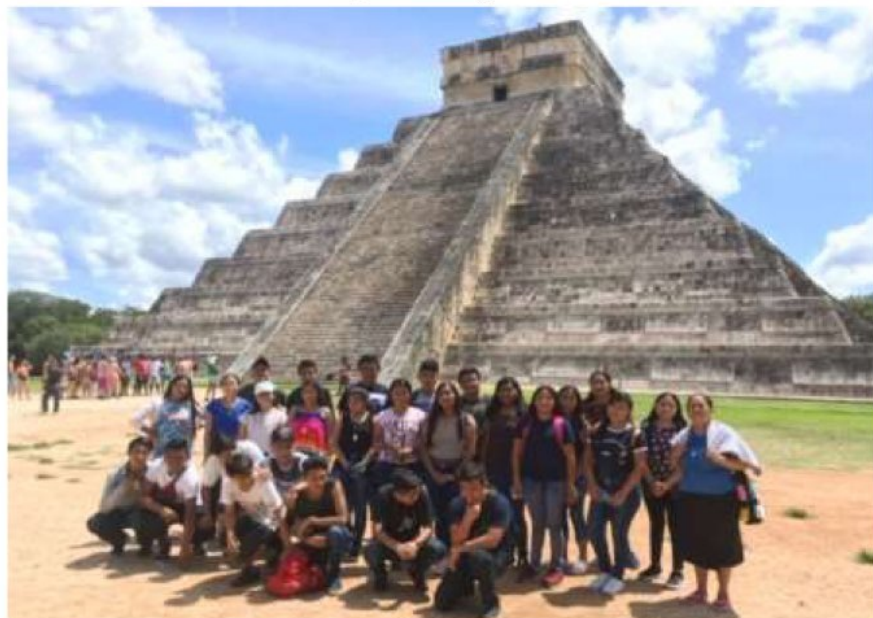
Students from the Mayan Children's Village visit a Mayan ruin

Students work hard in school, but it's not all chores and homework at the Mayan Children's Village. Sometimes they also get to go on fun field trips! In October, they all went to a cenote and visited Chichen Itza to connect with their Mayan heritage.