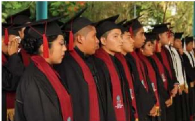
2019 students from VIM graduate from high school

Prompted by the Acción leaders in Mexico and trusting in God, we've started a campaign for 5-year pledges of new operating funds to open Women's Student House. Your pledge will enable one full class of high school students reach their dreams of receiving a college degree.